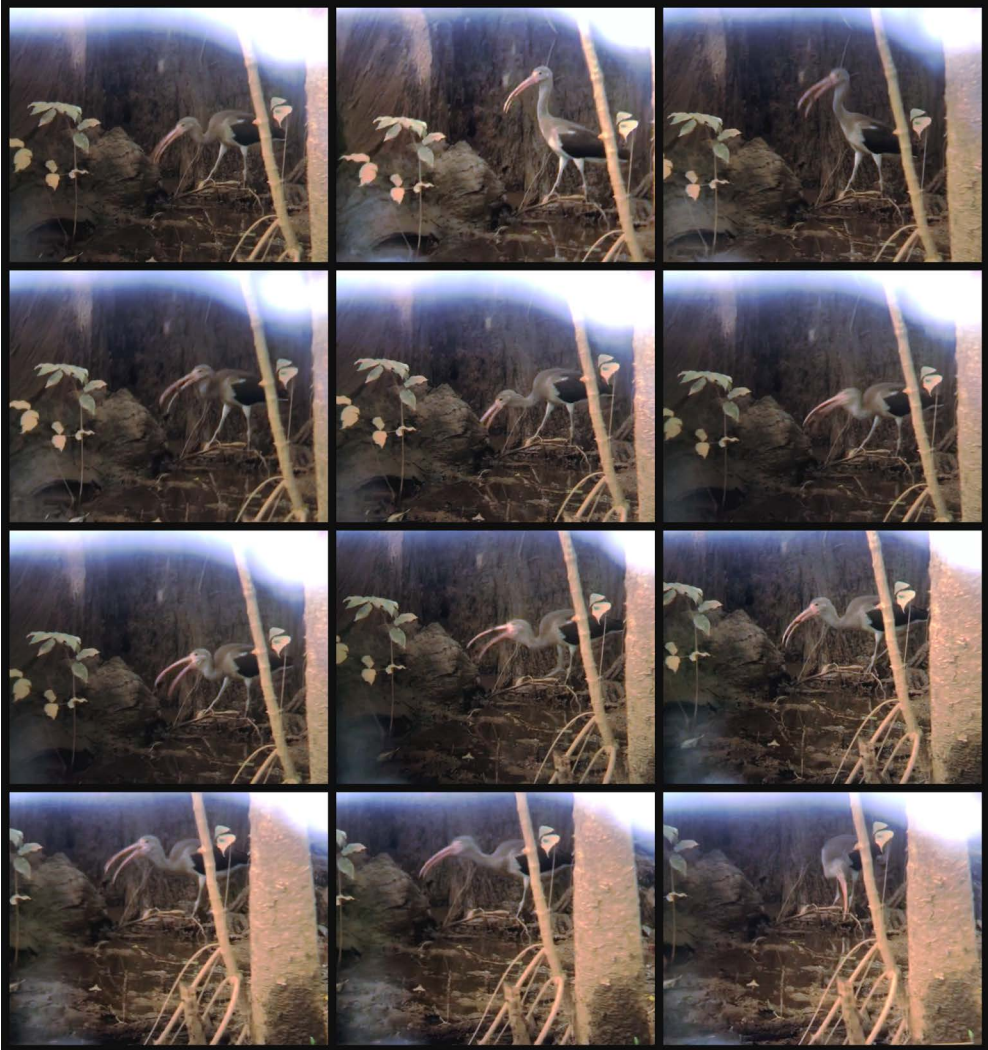
Fig. 2. Photographic sequence of predation by a juvenile White Ibis ( Eudocimus albus ) on Minuca osa from Ponuga, Veraguas, Panama. Still images should be interpreted starting from the upper left frame to the lower right; see link ( https://youtu.be/JA8rjwRw-Zo ) for Appendix 1 video