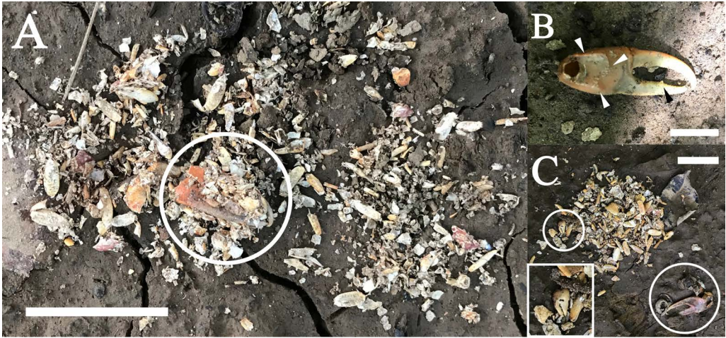
Fig. 3. Crab remains on White Ibis ( Eudocimus albus ) droppings from Ponuga, Veraguas, Panama. A: Various crab exoskeleton fragments; the white circle represents a male Minuca osa major claw. B: Four morphological characters (black & white triangles) from the major claw corresponding to Minuca osa found in White Ibis droppings. C: Fragments of at least two crab species contained in White Ibis droppings; Minuca osa (lower right corner circle) and a Sesarmid crab (small circle and crop). Scale bars: A = 40 mm, B = 15 mm, C = 5 mm

Fig. 3. Restos de cangrejo en heces de Ibis Blanco ( Eudocimus albus ) de Ponuga, Veraguas, Panamá. A: Fragmentos varios de exoesqueleto de cangrejo; el círculo blanco representa la quela mayor de Minuca osa , macho. B: Cuatro caracteres morfológicos (triángulos negro y blanco) de la quela mayor correspondiente a Minuca osa encontrada en heces de Ibis Blanco. C: Fragmentos de al menos dos especies de cangrejos contenidos en heces de Ibis Blanco; Minuca osa (círculo inferior derecho) y un cangrejo sesarmido (círculo pequeño y recuadro). Escala: A = 40 mm, B = 15 mm, C = 5 mm