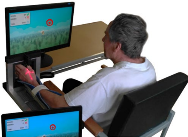
Figure 2. Exercise demonstration of a patient in a rehabilitation facility under supervision. Note: derived from research.

If the patient has achieved enough goals (more than 80 %) in the previous exercise and thus met the expectations, the following goals will be generated more difficult by the constant \alpha = 2\% . For example, after a successful exercise, \delta + \alpha = 77\% of the maximum values for next stage (thus new \delta_n = 77\% ). If the patient achieves results between 45 % and 80 %, \delta_n = \delta in that case. But if the score is less than 45 % during the exercise, the scale is \delta_n = \delta - \alpha , even if the exercise is very problematic and the rate is less than 20 %, then \delta_n = \delta - 3 * \alpha . The game score is created based on the number of captured targets. We can see a sample exercise in Figure 2.